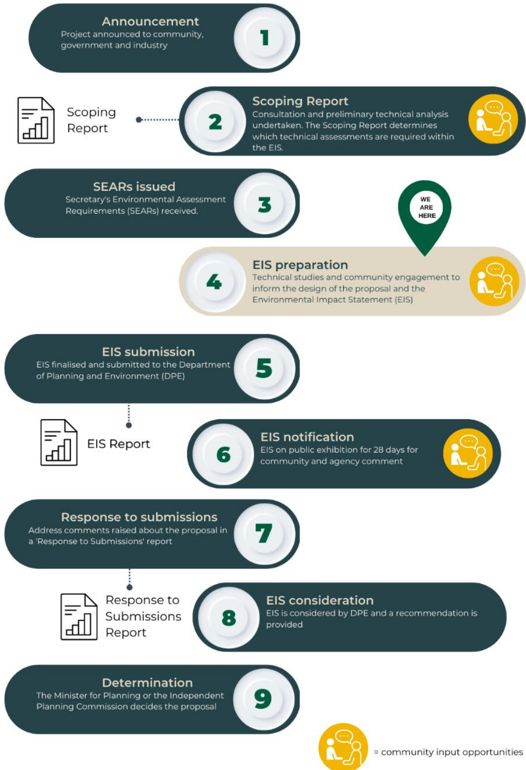
Figure 1.2 NSW SSD Timeline