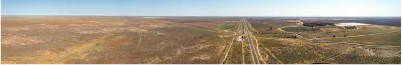
Drone footage of the site taken from the Sturt Highway facing west.

We plan to carry out detailed site investigations including flora and fauna, heritage surveys, noise and visual impact assessment and traffic and transport studies. The results of these studies, as well as feedback from the community, will help us to refine the current preliminary layout of the potential wind farm.